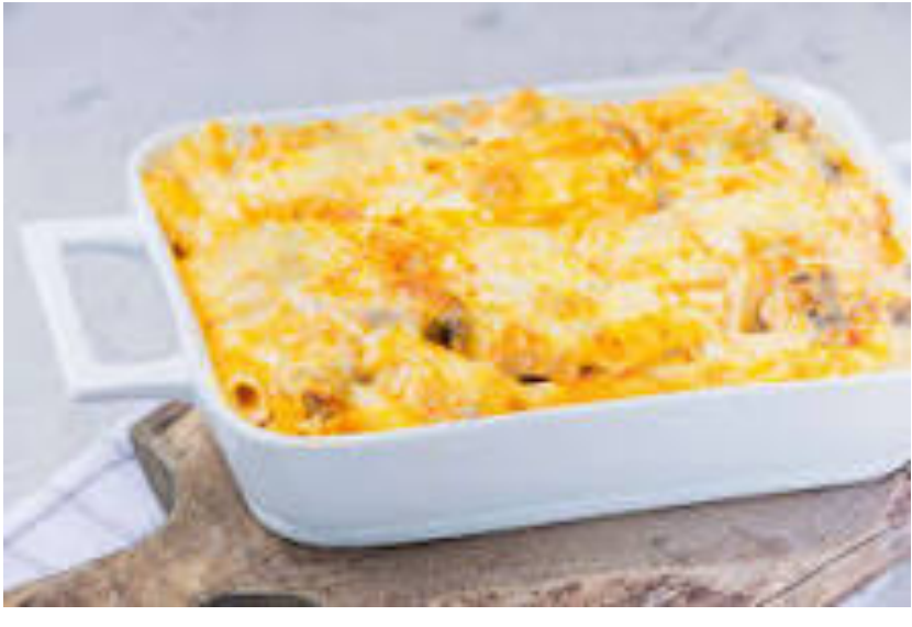
Baked chicken and pasta with four cheese sauce! Yum!!!!!